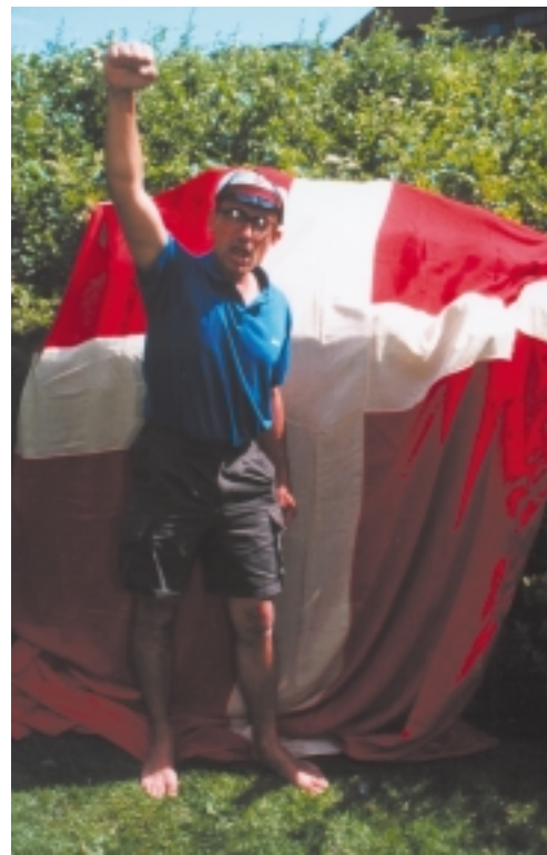
Colonel, A Danish Student