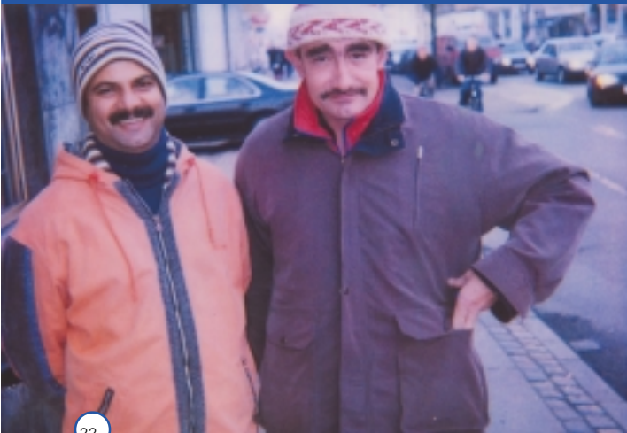
Colonel, From Nepal