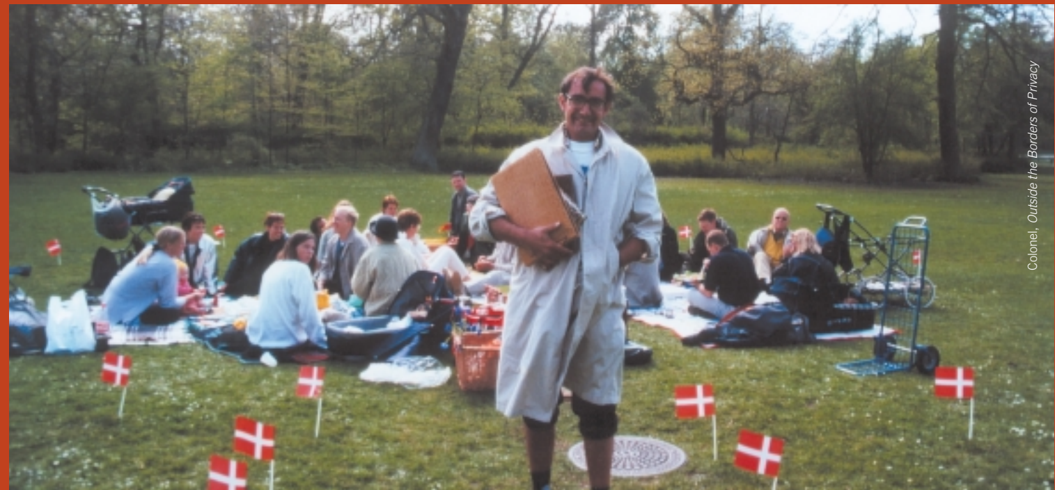
Colonel, Outside the Borders of Privacy