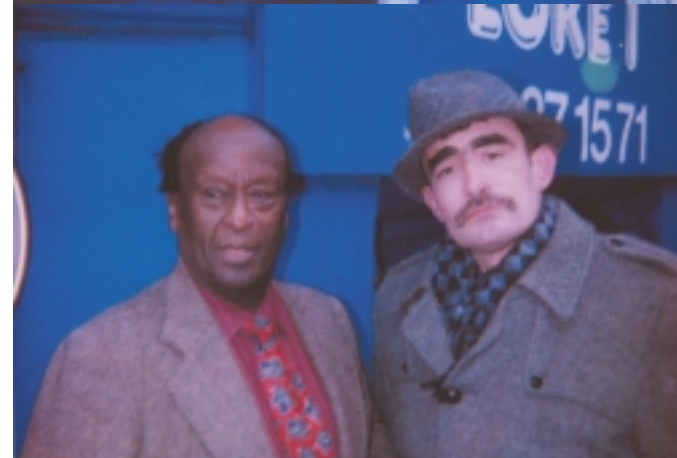
Colonel, From Somalia