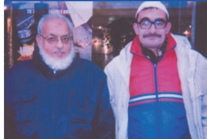
Colonel, From Pakistan

Visionerne om den visuelle kulturs centrale rolle i denne udvikling er både sympatiske og tiltrængte. Problemet, eller måske den fælde som dette og lignende arrangementer kan gå i, ligesåvel som man som privatperson kan stå i det dilemma, er imidlertid hvordan man håndterer en jævnligt tilbagevendende uoverensstemmelse mellem ord og handling. Ofte udfolder der sig en retorik om kulturel mangfoldighed, hvor der hurtigt kan nås til enighed om nødvendigheder som åbenhed overfor andre mennesker og udtryksformer, dialog med anderledes kulturer, redefinering af hvad kvalitet er m.m. Denne enighed er såvel velment som positiv. Men her, og i andre lignende sammenhænge, findes en tendens til at debatten ender som en retorikkens status quo, hvor der faktisk ikke handles, eller ikke handles i overensstemmelse med det man siger. I stedet giver sproget en øjeblikkelig tilfredsstillelse, hvor man næsten tror på, at man gør det man siger, og gentages tingene